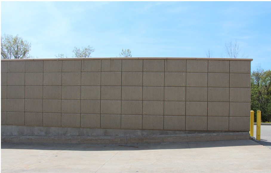
WALMART LOADING AREA, MARKHAM, ON