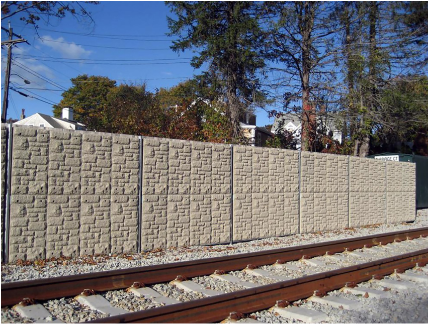
RAIL REHAB, BRAINTREE, MA