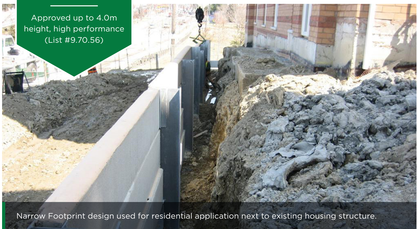
Narrow Footprint design used for residential application next to existing housing structure.

Approved up to 4.0m height, high performance (List #9.70.56)