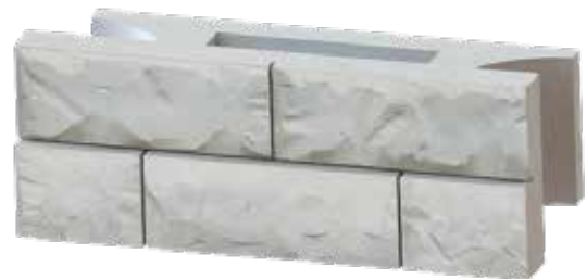
TOP FULL BLOCK (TA)