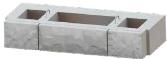
HALF BLOCK (A.5)