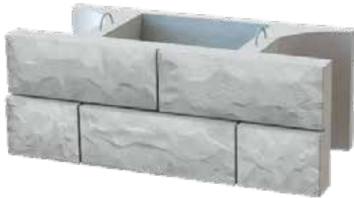
FULL BLOCK (A)