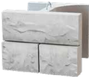
FULL HEIGHT/HALF WIDTH BLOCK (HA)