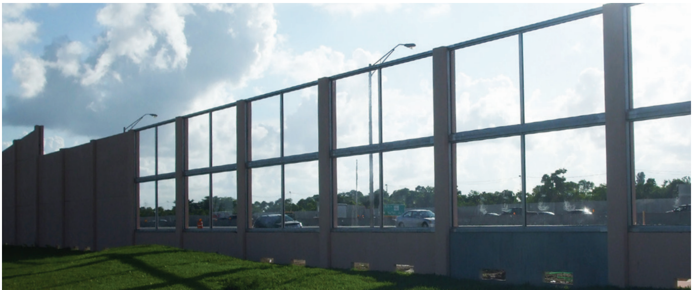
MIAMI, FL - ACRYLITE® SOUNDSTOP READY-FIT PANELS