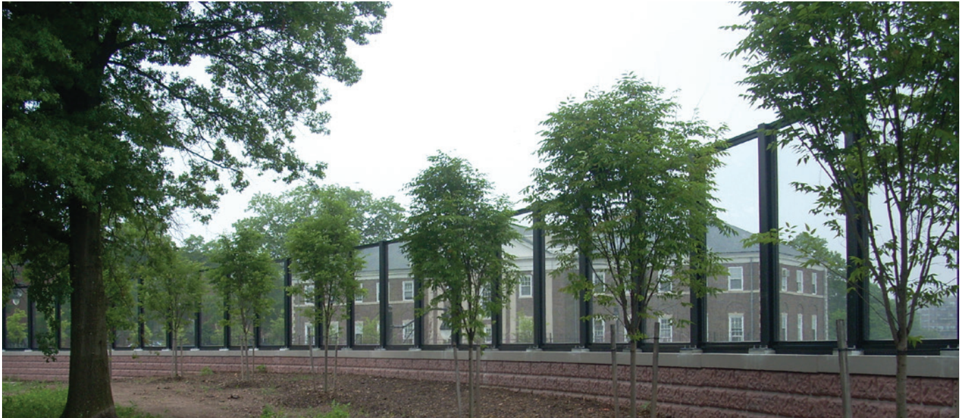
NEW BRUNSWICK, NJ - ACRYLITE® READY-FIT PANELS