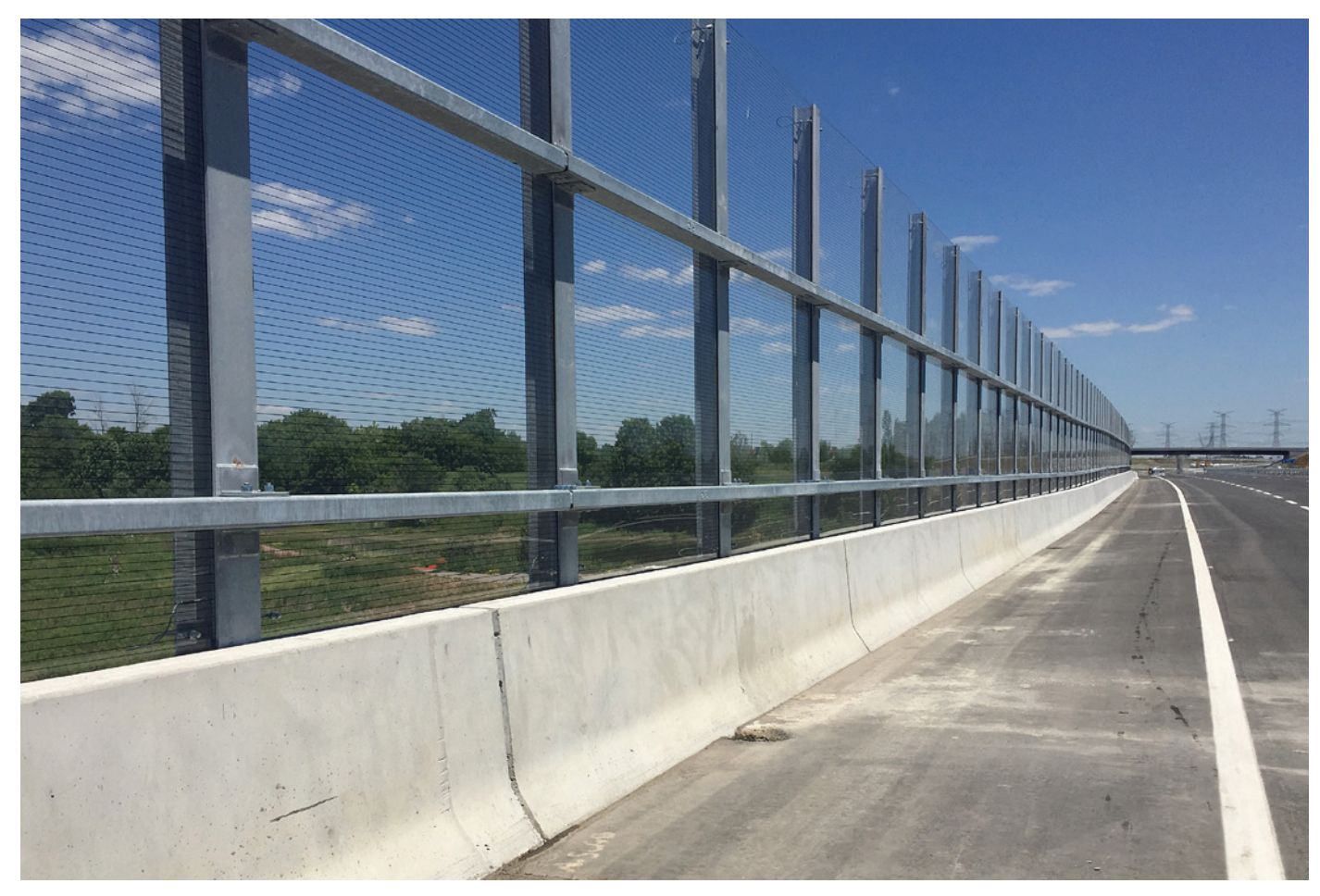
TORONTO, ON - ACRYLITE ^{\circ} SOUNDSTOP TL-4 SYSTEM