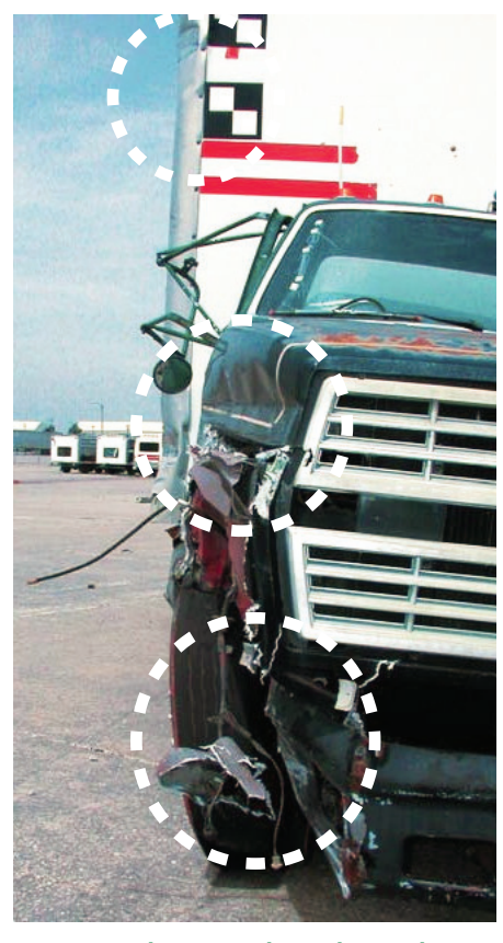
Damaged areas show how the TL-4 System reduces the severity of the crash