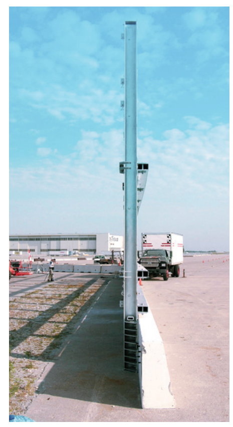
A 8,164kg truck impacts the TL-4 System at 60mph on a 25° angle

350 Test Level 4 - Midwest Roadside Safety Facility, Lincoln, NE, USA