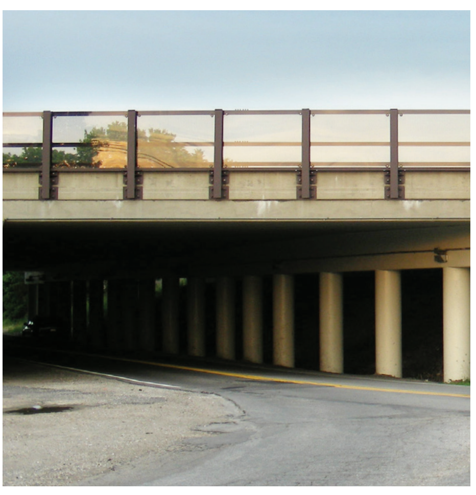
COLUMBUS, OH - ACRYLITE® SOUNDSTOP TL-4 SYSTEM