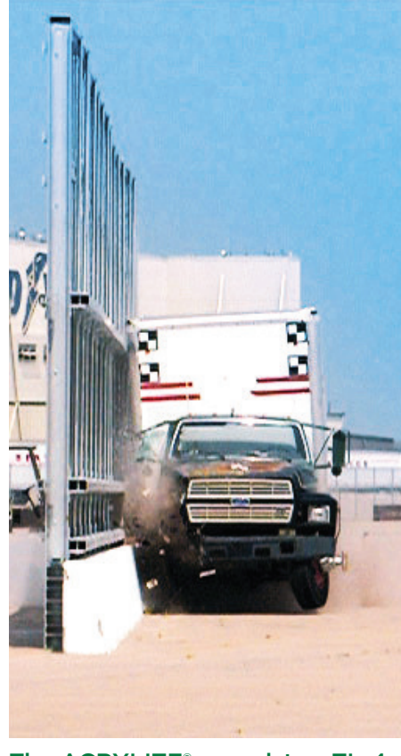
The ACRYLITE® soundstop TL-4 System stabilizes the vehicle after impact